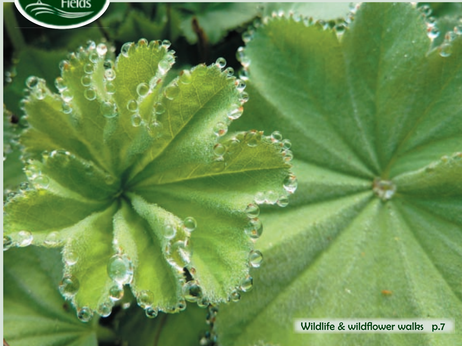
Wildlife & wildflower walks p.7