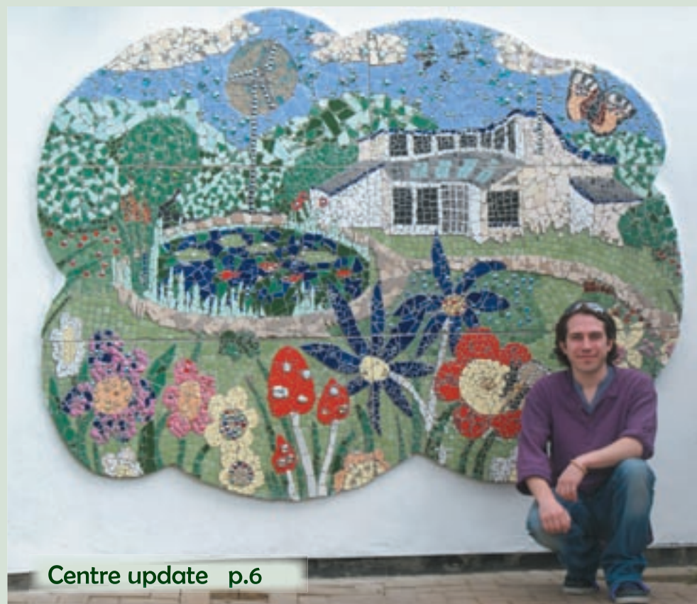
Centre update p.6