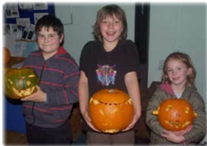
Pumpkin Evening: Winners of the 8-16 category of the pumpkin carving competition.

The competition is open to all children in the York area. The competition will be judged in two age groups: under 8 years and 8-16 years, one winner will be chosen from each group. Winners will win gift vouchers worth £20 and the winning designs will be made into large posters and displayed across the city as part of the York Rotters Christmas compost campaign. All entries should be on A4 paper and received by Friday 28th November .